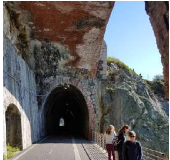
Le gallerie tra Moneglia e Sestri Levante

Oltre a combattere con il congiuntivo... faccio trapunte per regali e beneficenza, ma adoro iniziare qualcosa di nuovo, quindi ho molti UFO (oggetti non finiti) COVID-19 mi ha dato il tempo di recuperare e ho finito 10 trapunte.